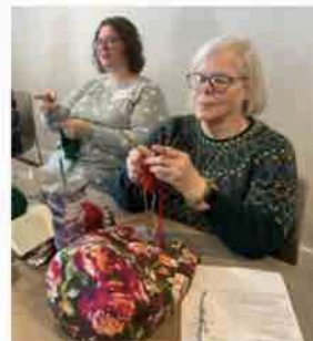
Take a workshop or two