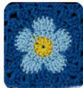
Crochet Chart Reading