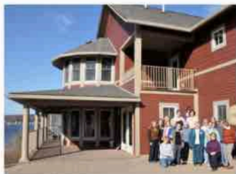
Stay in the beautiful Wegman House