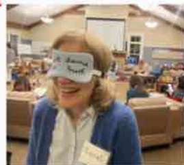
Ewe NEED a Retreat!