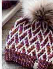
Mosaic Knitted Hat