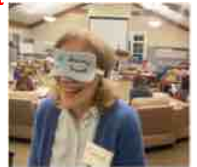
Ewe NEED a Retreat!