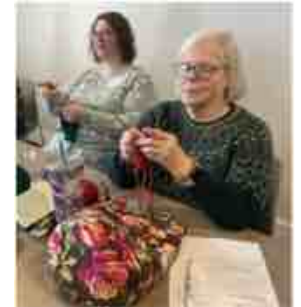
Take a workshop or two