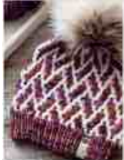
Mosaic Knitted Hat