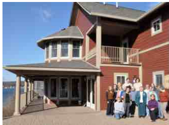
Stay in the beautiful Wegman House