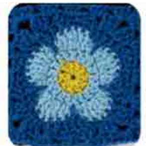
Crochet Chart Reading