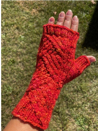
Traveling Stitches Mitts