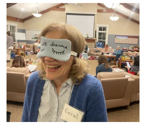
Ewe NEED a Retreat!