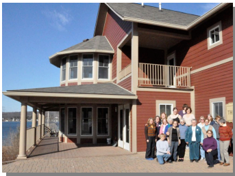
Stay in the beautiful Wegman House