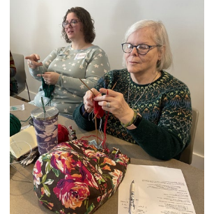
Take a workshop or two