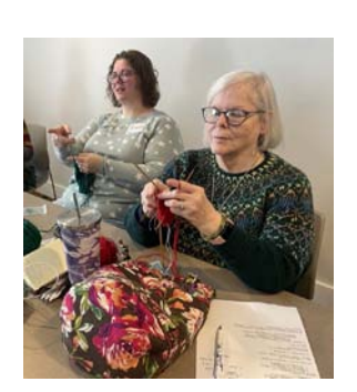
Take a workshop or two