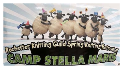
A weekend of knitting fun. Friday Evening: