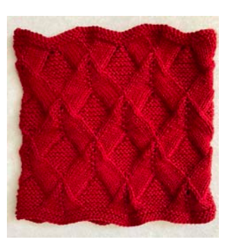
Op Knit Texture Cowl