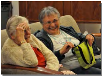
Scenes from the 2013 Retreat