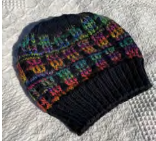
Tartan Plain Workshop