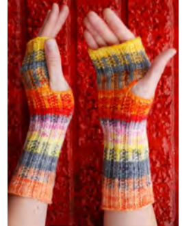
Blur: Fingerless Mitts