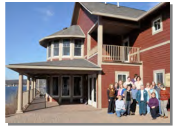
Stay in the beautiful Wegman House