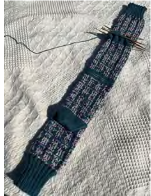
Magically Turn One Long Sock into a Pair