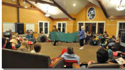
Explorations in Color