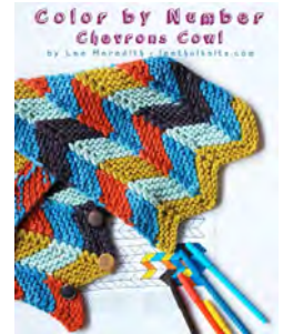
Color By Number Chevron Cowl