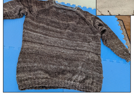
Raglan pullover sweater in natural brown Lincoln handspun. It's the first sweater I've undertaken in years and I'm so very happy with it. Meg Weglarz